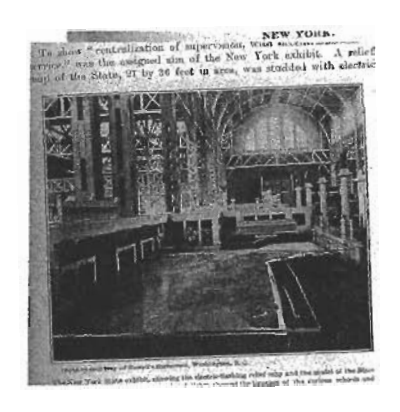
New York State Topographic Model, 9m \times 12m , with lights of different colors representing educational institutions. (Ryan, W. Carson (1916): "Education Exhibits at the Panama-Pacific International Exposition", Bureau\ of\ Education\ Bulletin\ 1 ).

visual field, and with objectives similar to what we have seen in the previous section. The pavilion hosted displays from the United States Government; from a number of states, including Massachusetts, New York, Pennsylvania, Illinois, Oregon, Utah, Wisconsin and California; and from foreign countries such as China, the Philippines, Argentina and Uruguay. In this section my analysis focuses on the exhibits of the US states. For the purposes of this paper, my chief objective is to understand what exhibitionary styles and curatorial principles were employed in the education palace. As will become clear, this allows us to see what forms of attention were desired and produced as American education was presented to the world and its further advancement envisioned.