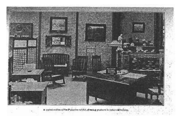
Section of Philippine Exhibit at 1915 Exposition, showing industrial products. (Ryan, W. Carson (1916): "Education Exhibits at the Panama-Pacific International Exposition", Bureau of Education Bulletin 1).

Absent from the Philippines' 1915 display were the living anthropological displays that had been a key feature of the 1904 exhibit. At the earlier exposition 1200 Filipinos and Filipinas had been brought to Missouri and organized into villages that were to represent different stages of "civilizational" evolution. A model missionary school was displayed where loin-clothed Igorots – one of the higher-ranked ethnic groups – demonstrated their potential to be further civilized to President Roosevelt by singing "My Country 'Tis of Thee". The St. Louis / San Francisco shift was from an "attraction" that was "strange, curious or bizarre" and designed to "startle" or "amuse" visitors to an exhibit that would be a "proper" public presentation. The 1915 display was designed so as not to distract from the civilizing process underway. It would instead direct attention to accomplishments: to systems and processes, the "manner" in which enlightenment was being carried out. The display would also direct "proper" forms of attention – not the attention that would be seized by a startling, transient curiosity but attention that would be a more studied and reflective intellectual concentration.